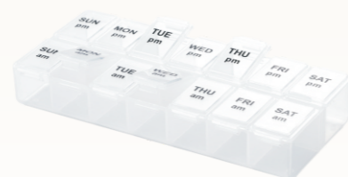
GT164-110 14 Case Pill Box Material: PP Size: 13.5x7x2.5cm