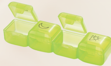
GT164-101 4 Case Pill Case Material: PP Size: 12x3x3.2CM