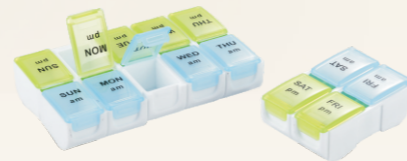
GT164-105 14 Case Detachable Material: PP size: 17x7.2x2.5cm