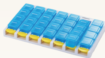
GT164-107 28 Case Pill Box Material: ABS+PP+PS Size: 21x12.5x2.3cm