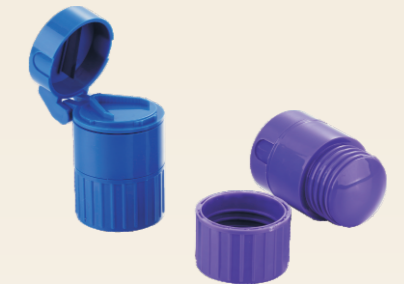
GT164-202 Multifunction Medical Pill Crusher Material: ABS+Stainless Steel Blade