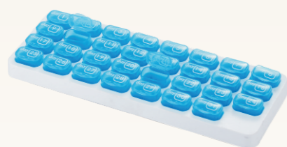
GT164-106 31 Case Pill Box Material: HIPS+PP Size: 28.5x10.5x2.8cm