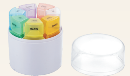
GT164-114 Oval 28Case Pill Oegnaizer Material: ABS+PP+PS size: 9x9x10cm