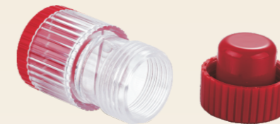
GT164-201 Pill Crusher Material ABS+ PS Feature Crush And Store Pills Colour Blue; Red; White Function Easy To Use For Pill Storage And Crushing