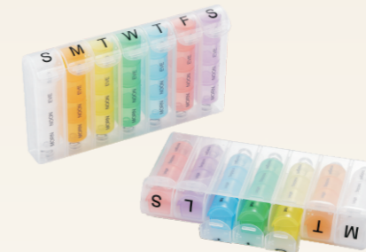
GT164-113 28Case Pill Box Material: PP Size: 20x11x3.8cm