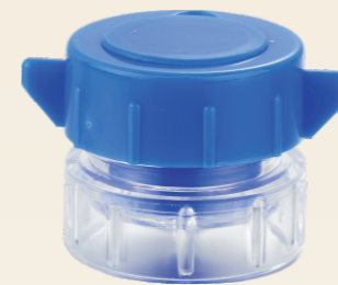
GT164-200 Pill Crusher Material: POM+ PS Feature Crush And Store Pills