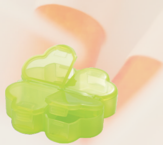
GT164-100 Lover Shape 4 Case Pill Case Material: PP Size: 8.3x8.3x2.1cm