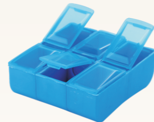
GT164-108 6 Case Pill Box Material: PP Size: 9x8x3cm