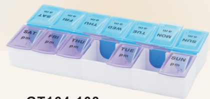
GT164-103 14 Case Pill Box Material: PP size: 18.3x9.3x3.3cm