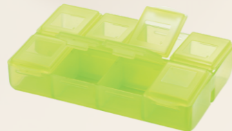
GT164-102 8 Case Pill Box Material: PP Size: 10x7x2cm