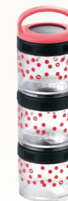
GT164-204 Multi-function Group of Storage Bottles Material: Tritan+HIPE Size: 6x6x20cm