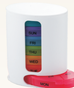
GT164-115 28Case Pill Oegnaizer Material: PP +ABS size: 9.6x5.9x12cm