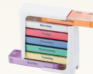
GT164-116 Drawer 28Case Pill Box Material: ABS+PS size: 10.5x12.6x4.3cm