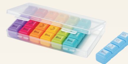
GT164-112 Keyboard Pill Box Material: PP size: 23x13x3.2cm