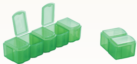
GT164-109 The Detachable 7 Case Pill Box Material: PP size: 17.5x3.5x2.5cm