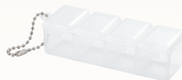
GT164-111 4 Case Pill Box Material: PP Size: 9.5x3.5x2.5cm